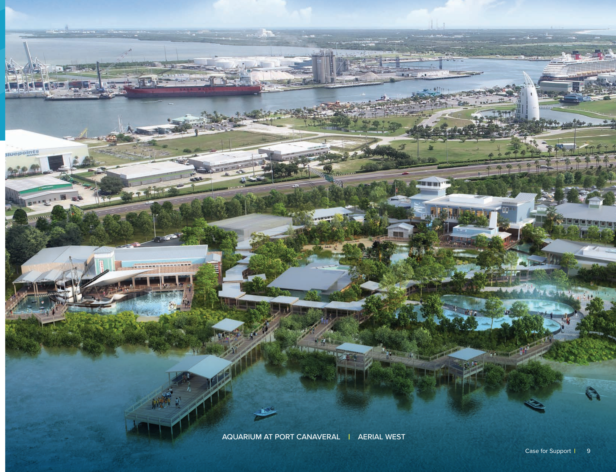
AQUARIUM AT PORT CANAVERAL | AERIAL WEST